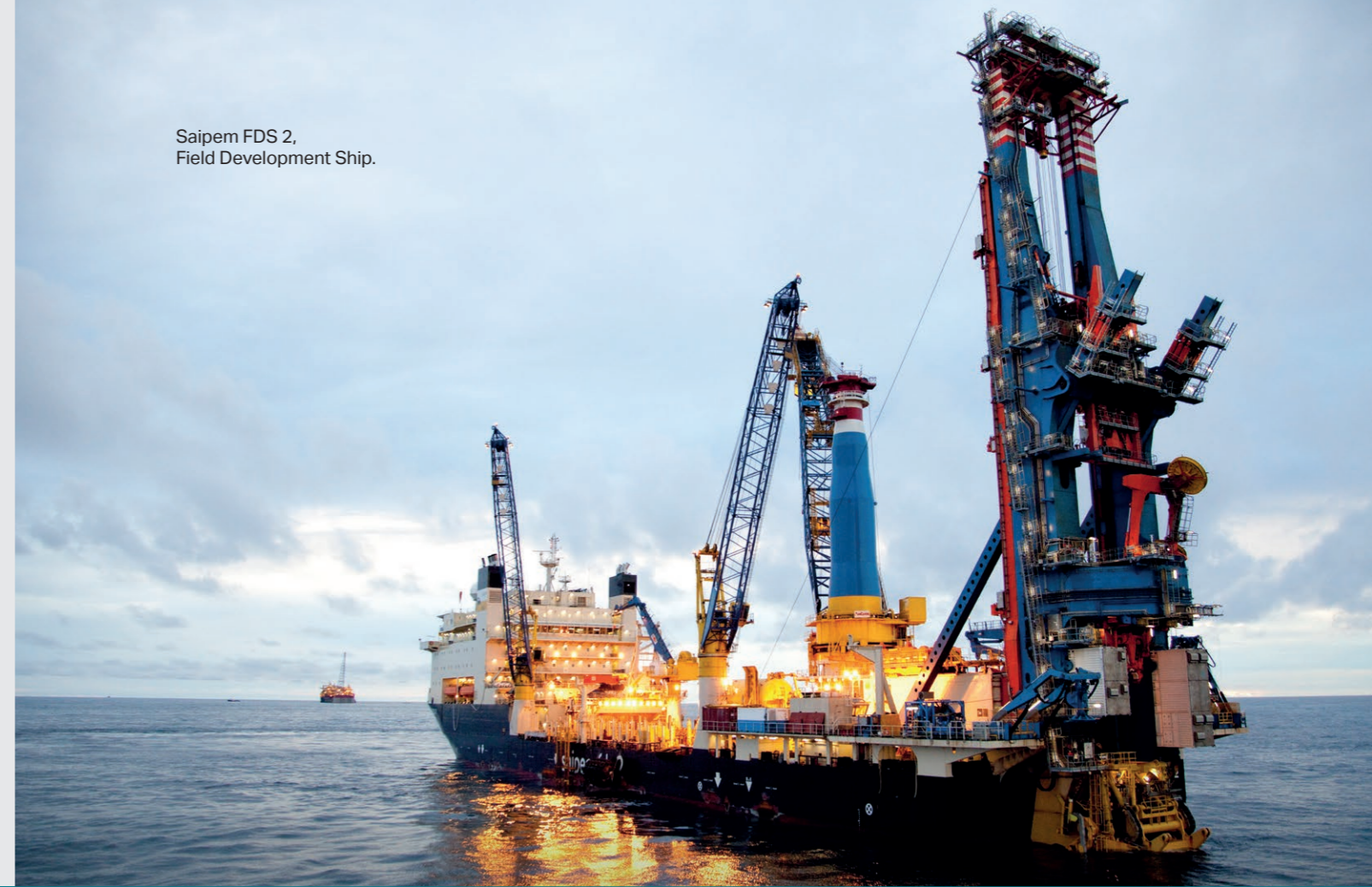
Saipem FDS 2, Field Development Ship.