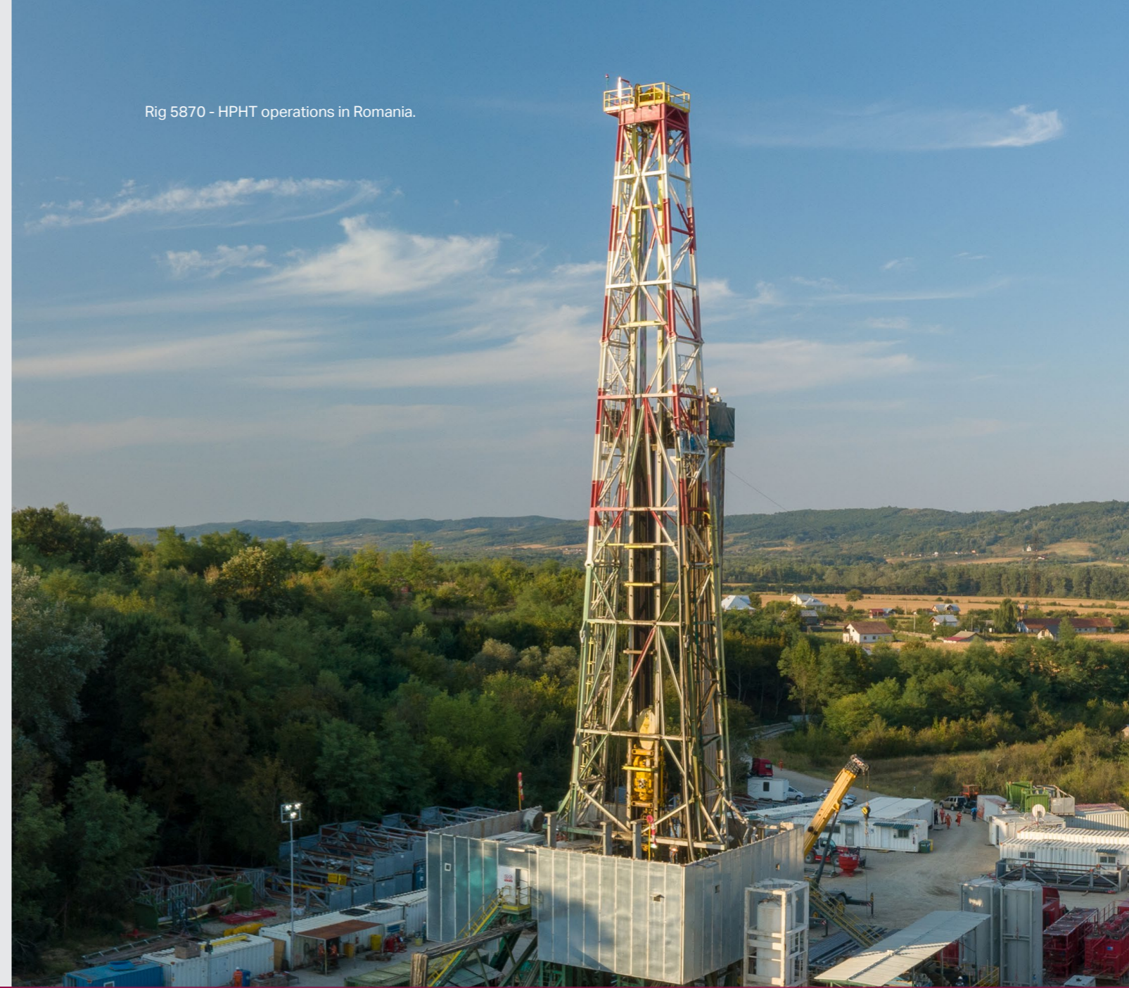
Rig 5870 - HPHT operations in Romania.