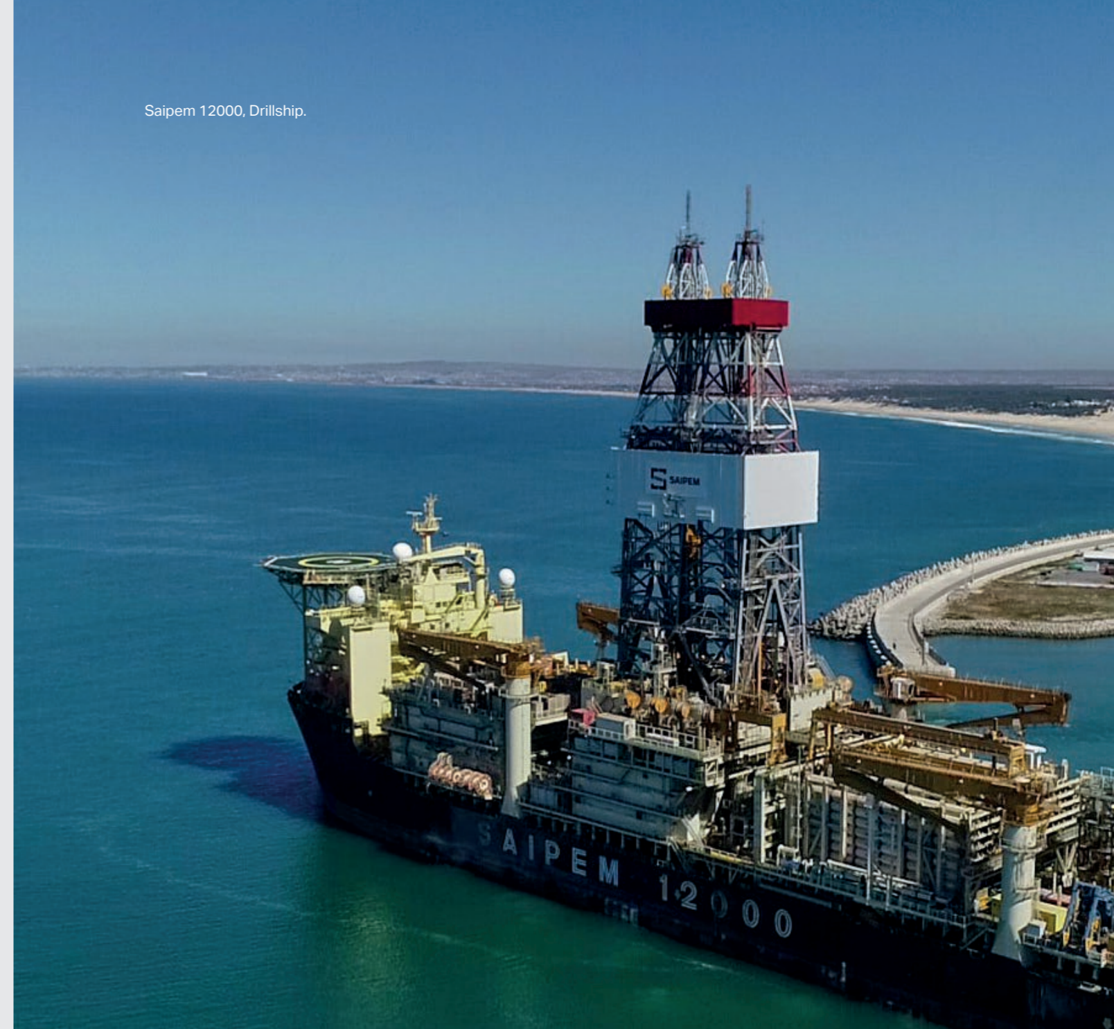
Saipem 12000, Drillship.