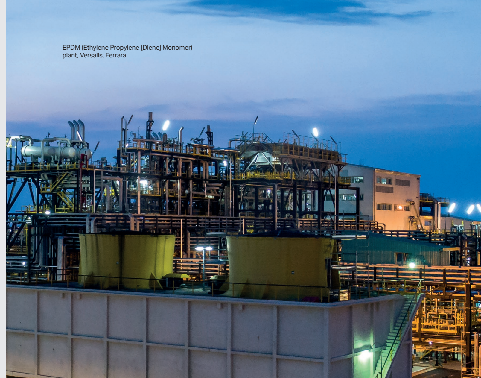
EPDM (Ethylene Propylene [Diene] Monomer) plant, Versalis, Ferrara.