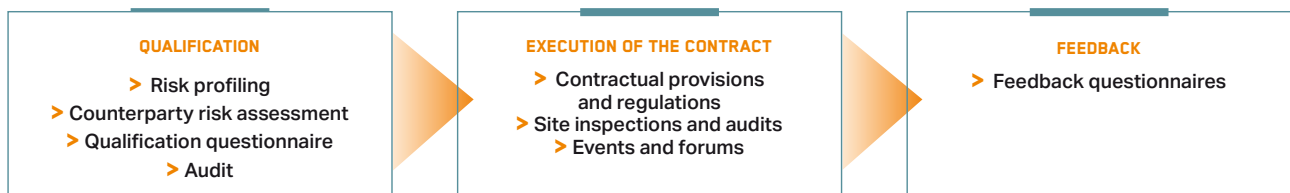
DIAGRAM OF KEY PROCESSES AND INSTRUMENTS IMPLEMENTED TO MANAGE SUSTAINABILITY ISSUES IN THE PROCUREMENT CHAIN

Saipem's suppliers are bound by contractual clauses to comply with the principles of the Code of Ethics and respect human rights in conformity with Saipem's sustainability policy. We also demand that they require respect for the same principles and standards from their own suppliers, thus guaranteeing safe and